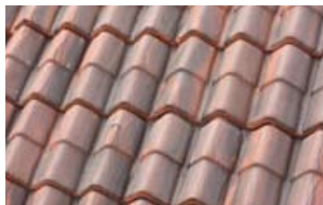
RUSTIC BROWN [N.5]