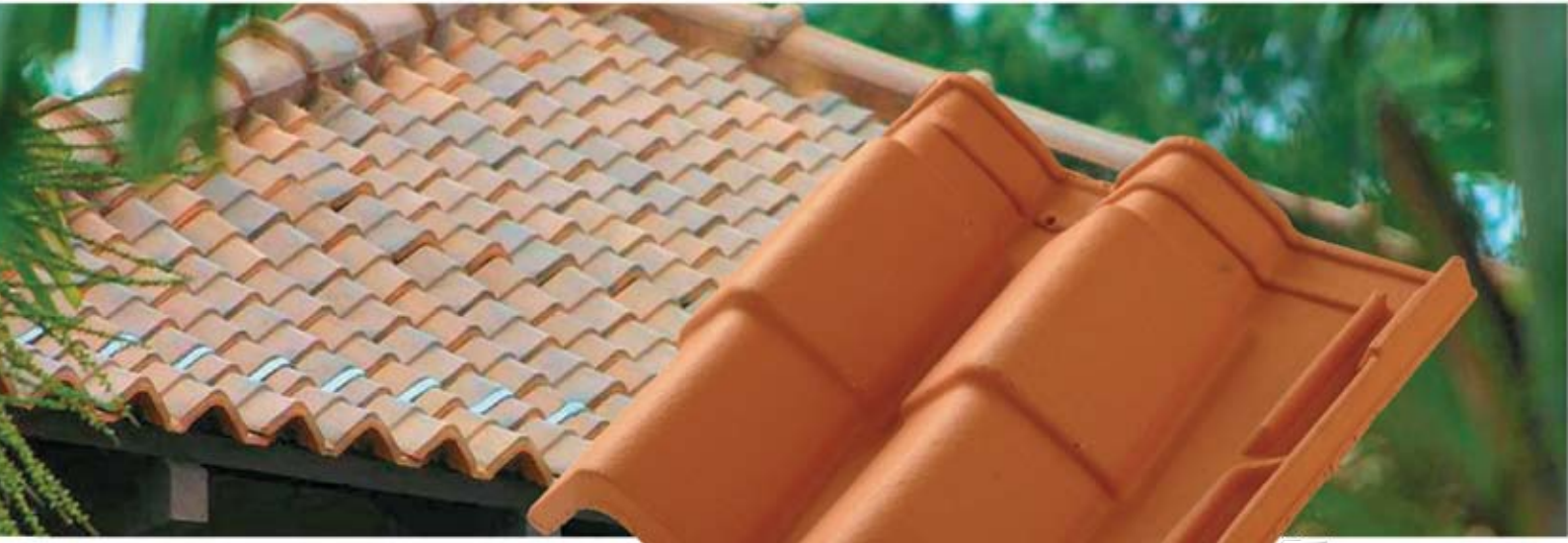
Colour: Natural Tone France

P eranakan 8 is developed to provide the security and easy-laying inherent to a contemporary model of tile, yet preserving the traditional V-concept.