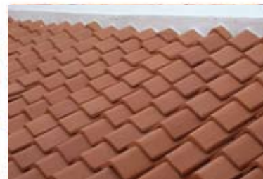
NATURAL TERRACOTTA [N.1]

*Note: Metal sheet underlay is compulsory. Please contact our technical department if otherwise