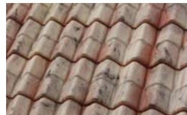
PINANG ANTIQUE [T.1]